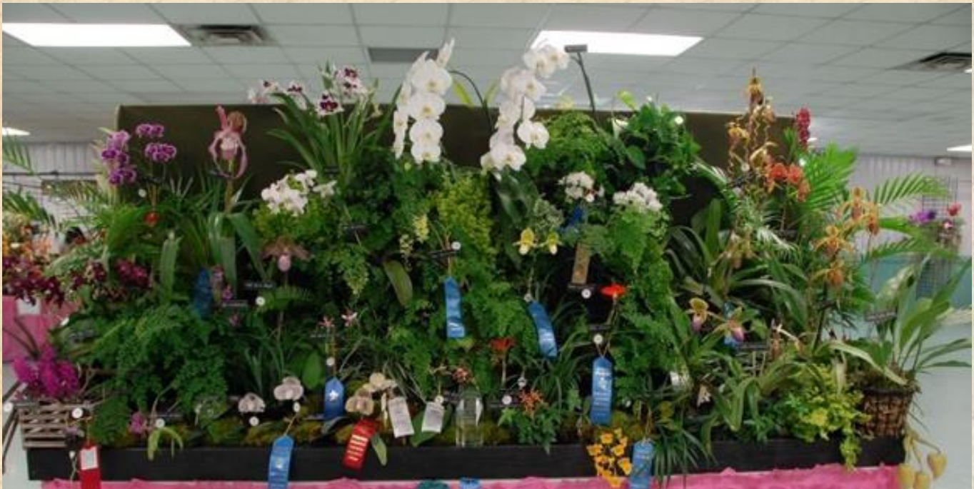
Jacksonville Orchid Society Exhibit at Volusia—2016

Our next show is the Gainesville Show in October. Start planning which orchids you want to enter.