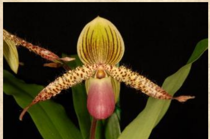
Paphiopedilum Transdoll 'Margaret C.' AM/AOS (82 points)