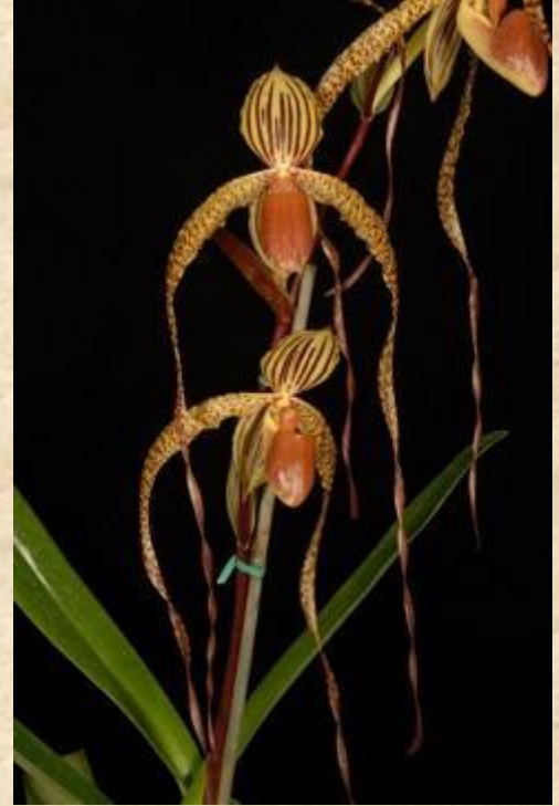
Paphiopedilum Shin-Yi Princess 'Bobby' AM/AOS (86 points)