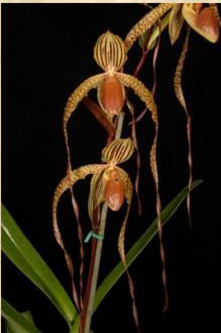
Paphiopedilum Shin-Yi Princess 'Bobby' AM/AOS (86 points)