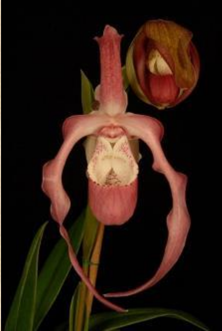
Phragmipedium America 'HM3 Doc Hicks' AM/AOS (85 points)