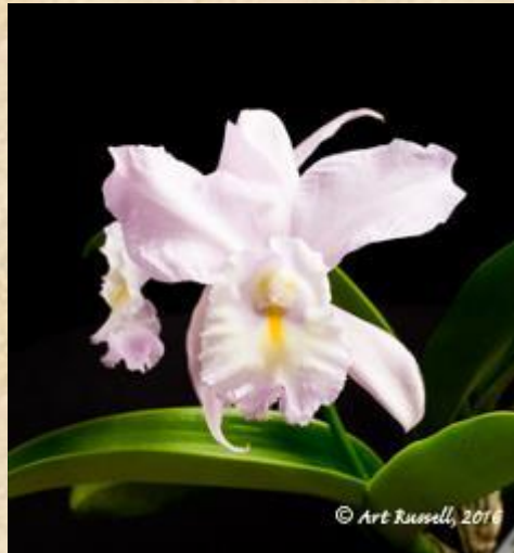
Cattleya Sea Breeze 'Blue Ribbon' Brian Esterak 2nd Place — Cattleya