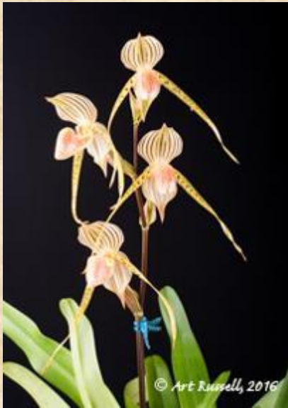
Paphiopedilum Lady Isabel 'Best' Brian Esterak 1st Place — Paphiopedilum