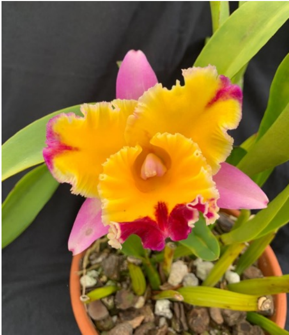
Congratulations to Lois Rasmussen! May's winner—Blc. Seta Rainbow 'Fantasy'

Post a picture of your prettiest orchid growing during the month on the JOS Facebook page . Include your name and the name of the orchid. A panel will judge the entries and select the prettiest orchid! Enter as many as you like! Participation is open to all members of the Jacksonville Orchid Society.