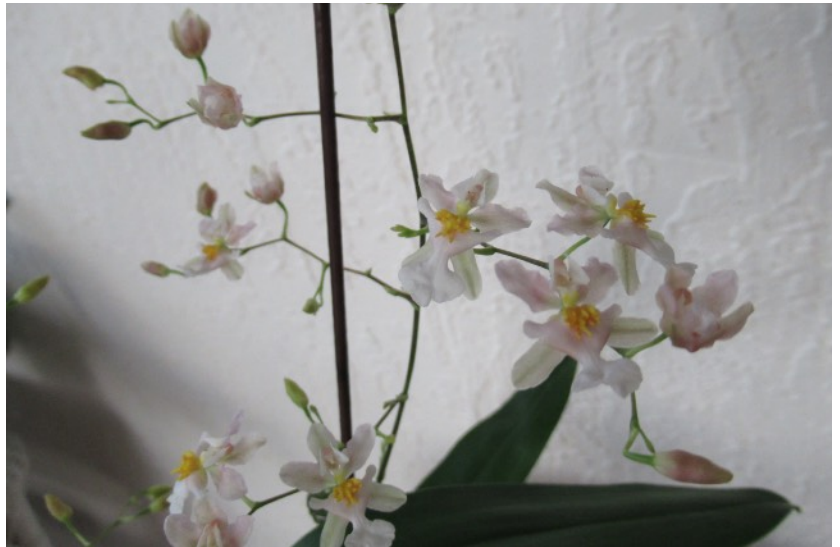
Onc. Gold Dust

Onc. Twinkle is a hybrid composed of two species of orchids: 50% Onc. cheirophorum and 50% Onc. sotoanum . These and all members of the Oncidium family are "New World" orchids and as such originate in the Americas. Onc. cheirophorum grows natively from Nicaragua to Columbia at higher elevations and Onc. sotoanum grows natively in northern Central America at lower elevations.