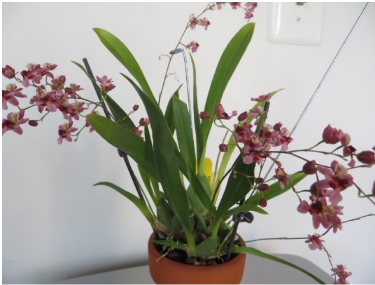
Onc. Twinkle 'Red'

Fir bark is commonly used as a medium to grow this orchid. However, as with all orchids, Onc. Twinkle will easily accommodate itself to whatever media you have available. The key is to