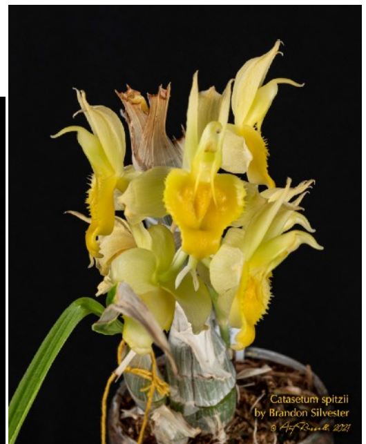
Cattasetum spitzli by Brandon Silvester © Art Russell 2021