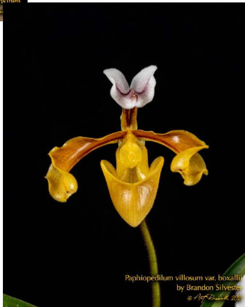
Paphiopedilum villosum var. boxallii by Brandon Silvester © Art Russell 2021