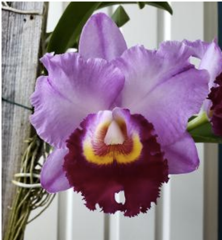
Congratulations to January's winner--Robin Campbell's Brassocattleya Shannon Conner

Post a picture of your prettiest orchid growing during the month on the JOS Facebook page. Include your name and the name of the orchid. A panel will judge the entries and select the prettiest orchid! Enter as many as you like! Participation is open to all members of the Jacksonville Orchid Society.