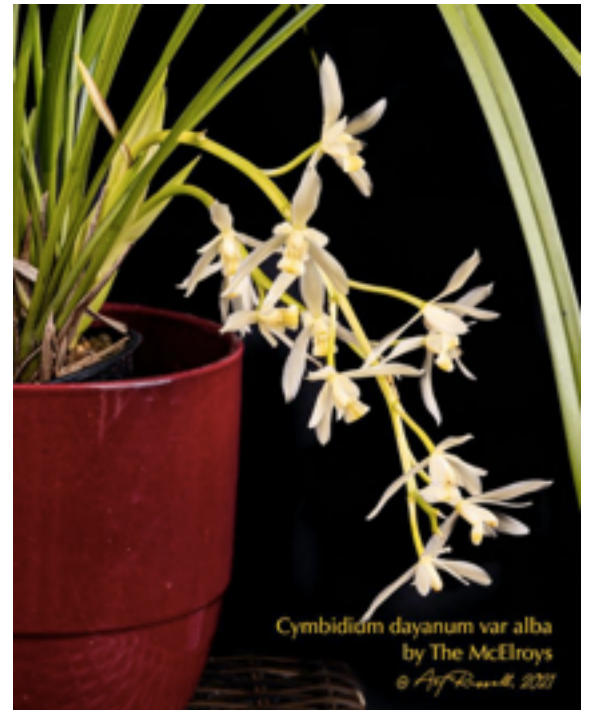
Cymbidium dayanum var alba by The McElroys © Art Russell, 2021