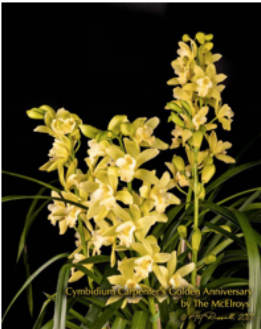
Cymbidium Carpenter's Golden Anniversary by The McElroys © Art Russell, 2021