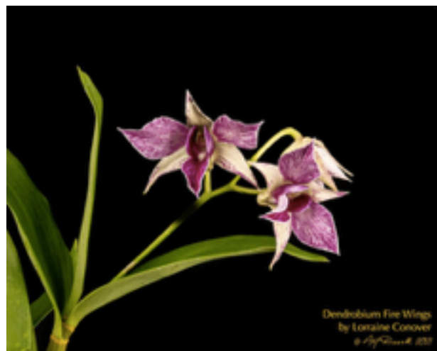
Dendrobium Fire Wings by Lorraine Conover © Art Russell, 2021